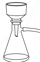
Buchner Funnel Filtration